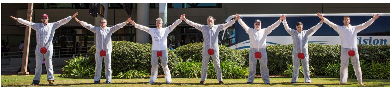
American men stand for the genital integrity rights of infants and children at AAP National Convention, 2012.